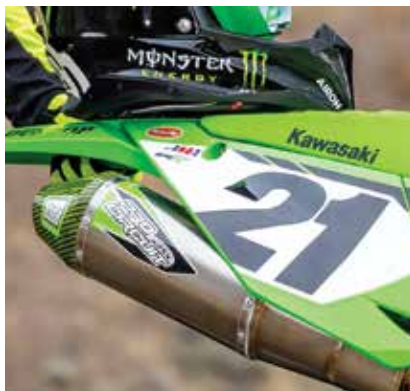
Ti-6 Titanium System