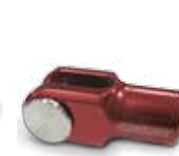
Rear Brake Clevis