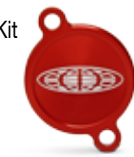
Oil Filter Cover