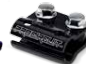
Brake Hose Clamp