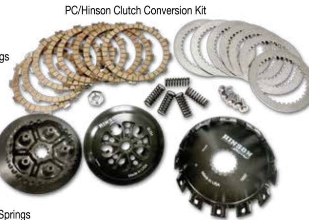
PC/Hinson Clutch Conversion Kit