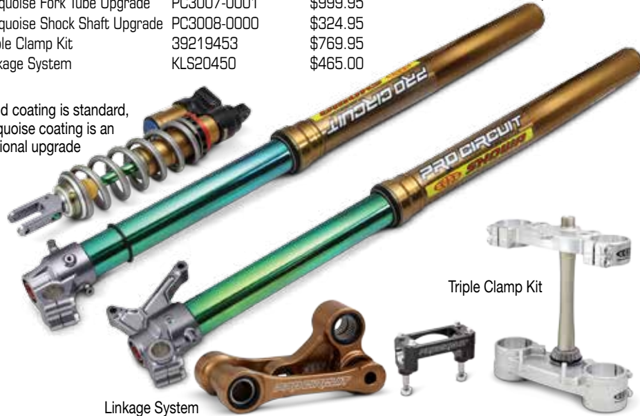
Works Showa Suspension

Gold coating is standard, turquoise coating is an optional upgrade