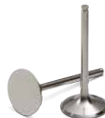
Titanium Exhaust Valves