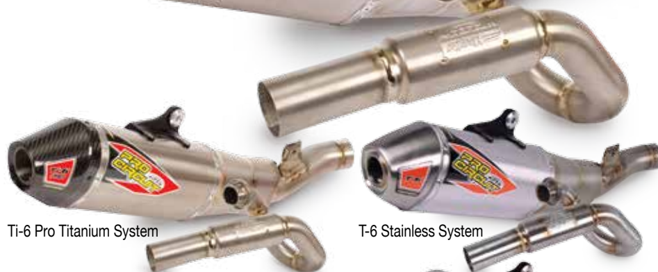
Ti-6 Pro Titanium System