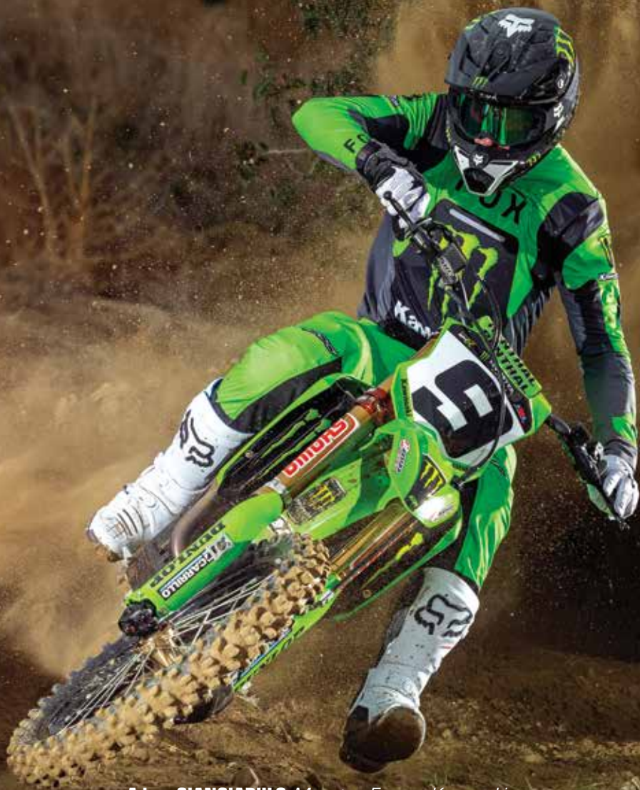
Adam CIANCIARULO Monster Energy Kawasaki