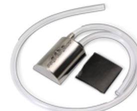
Titanium Catch Can