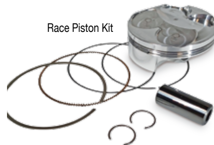
Race Piston Kit