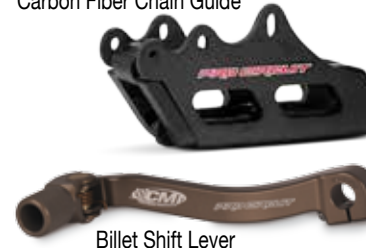
Billet Shift Lever