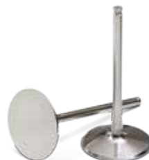
Titanium Intake Valves