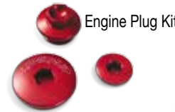
Engine Plug Kit